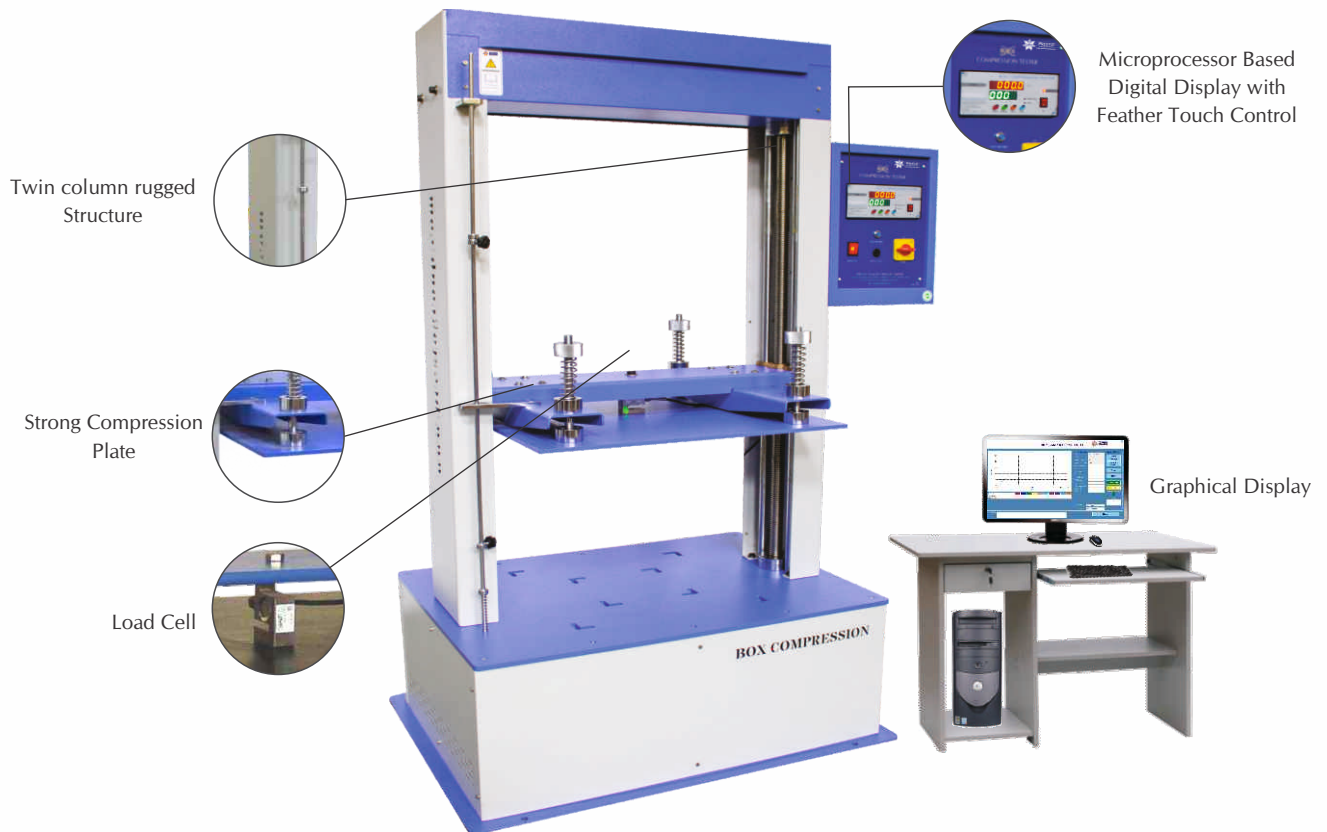
Model No : PBCC - 1000 (C)

Box Compression Tester is a consistent tool to indicate the Compression strength of cardboard boxes so that it does not get deformed or crushed when stacked one above the other during storage or transit. PRESTO Box compression Tester is manufactured under various Test Standards ASTM D642, ASTM D4169, TAPPI T804, ISO 12048, and JIS Z0212.